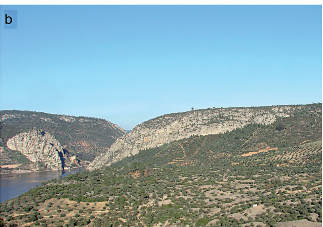
Figure 2 - a) Mouro Viewpoint through Zêzere river meander; b) Serrinha Geomorphological Viewpoint. Figure 2 - a) Un méandre de la rivière Zêzere depuis le belvédère Mouro; b) Le belvédère géomorphologique de Serrinha.

under several different frameworks (Rodrigues, Neto de Carvalho, 2010). Therefore, one of the main goals of this inventory is to include all the geosites in the municipal land management plans. For example, Serrinha Geomorphological viewpoint (Figure 2b) through Arneiro graben (protected by national law within Portas de Ródão Natural Monument) provides also a panoramic view over Portas de Ródão epigenic gorge and Conhal do Arneiro Roman gold mine. For instance, Penouco de S. Miguel viewpoint (fluvial) is protected as Sites of Community Importance - Natura 2000, however in Portugal it is clearly not enough to secure the landscape.