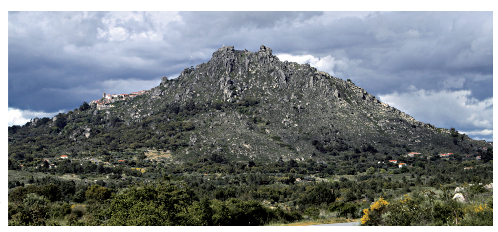
Figure 3 - Monsanto Inselberg. Figure 3 - L'inselberg de Monsanto.

The 16 geomonuments, as the main geopark attractions, are integrated in a common interpretation strategy (André et al. , 2011) with arriving direction signs on the road and site interpretative panels. But other geosites have site interpretation according with its geotourist and educational relevance because they are included in a walking trail, because of their previous recognition by local authorities or because their importance to the local tourist strategy. Some of them are included in walking trails focused in the landscape interpretation as in geotouristic trails (Rodrigues,